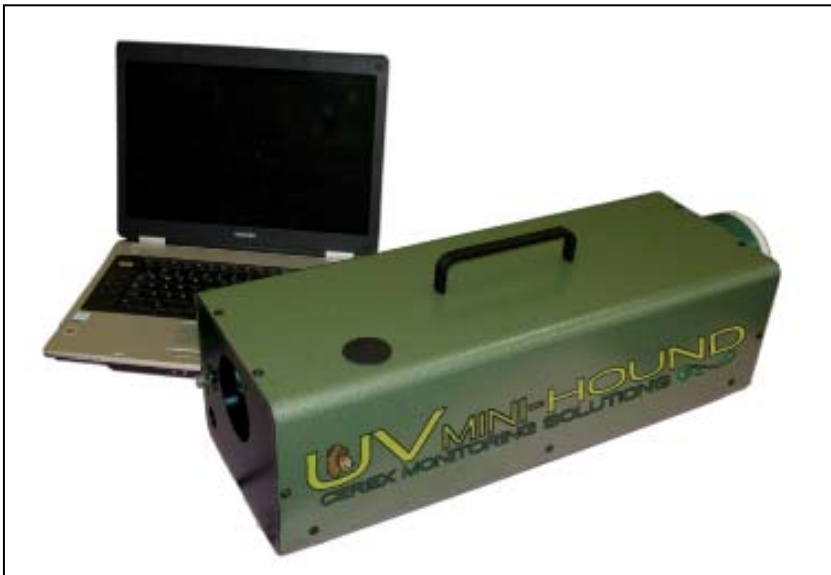
Shown above is the Cerex Mini-Hound. The smaller case size is more convenient in some applications. Minimum detection limits are higher than the full-size UV Hound.

The UV Source lamp is guaranteed for 2000 hours of operation. However, we have consistently noted that the typical life is in excess of 4000 hours.