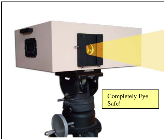
The AirSentry FTIR will project a 50mm beam of infrared light across the diameter of the stack to the reflector and then back again.

Cerex Monitoring Solutions, LLC is pleased to submit the following information regarding our AirSentry Portable FTIR Insitu Stack Analyzer system. The system is capable of multigas analysis and can be moved to various stacks. The AirSentry utilizes a cross-stack beam of infrared light to detect and quantify the gases of interest. The system quoted is a real-time air monitoring system that can provide detections for 400 compounds, but is particularly suited to highly corrosive gas species such as HCl, HF, HBr, etc. The system can be used on stacks w